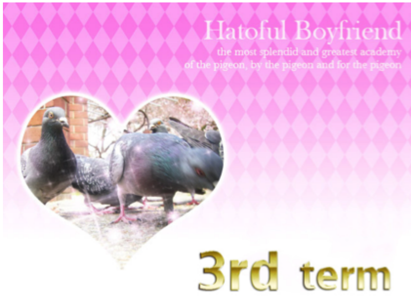
Figure 5 & 6. Framing narrative time in Hurtful and Heartful .

During the first class, everyone is evacuated to the gym and the birds are confused. The death of Hiyoko leads to many rumors and no one exactly knows why they have to remain in the gym. Ryouta narrates: