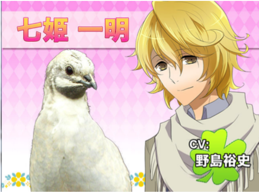
Figure 3. The characters are introduced in their pigeon form and as bishounen