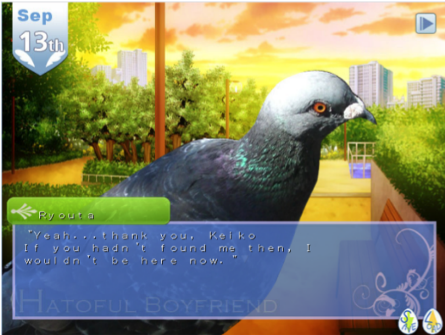
Figure 2. The player can date his childhood friend Ryouta and further understand his background story.