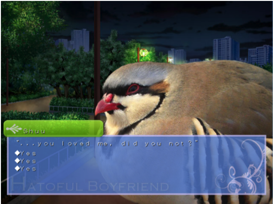
Figure 4. The player can only confess his love to Shuu