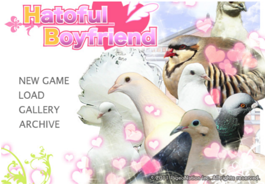
Figure 1. The opening menu of Hatoful Boyfriend frames it as cute and romantic through pink hearts.